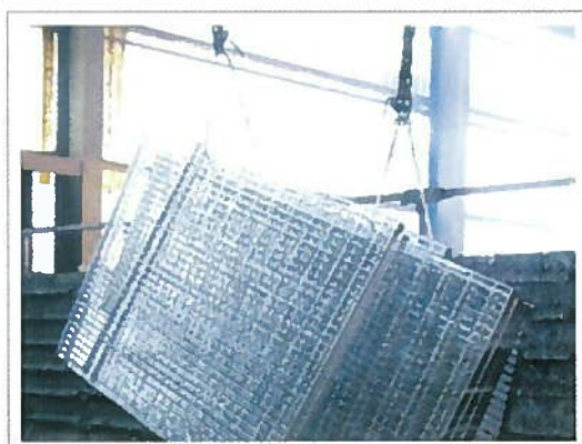
④ Hot Dip Galvanizing