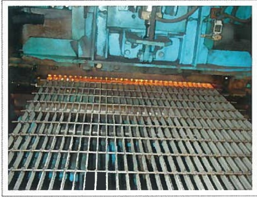
① Auto projection Welding

BOGIJAE have been fabricated in strict accordance N.A.M.M.(National Association of Architectural Metal-Manufactures)specification and high quality governed by our TQC system.