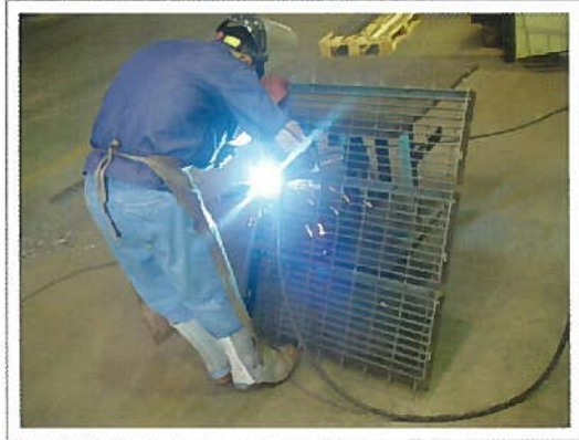
③ End Plate Welding